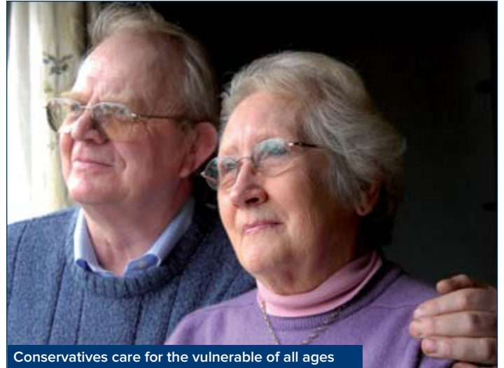
Conservatives care for the vulnerable of all ages

■ Conservatives are working closely with the NHS at all levels to provide the best possible service.