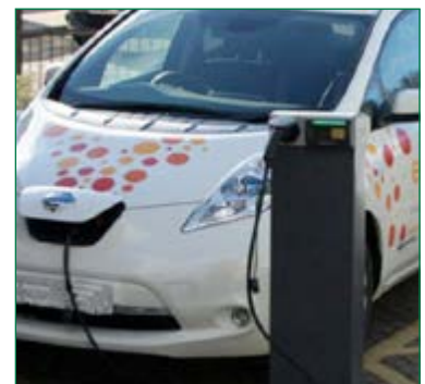
Installing electric vehicle charging